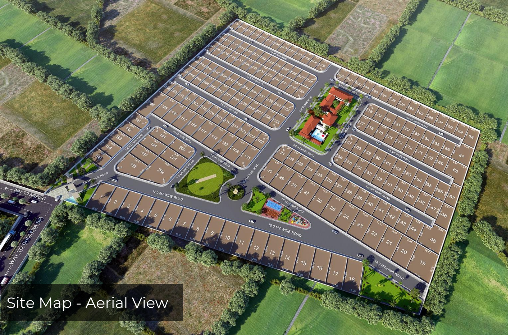
Site Map - Aerial View